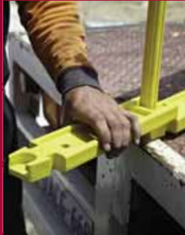
Assembling stile and rung