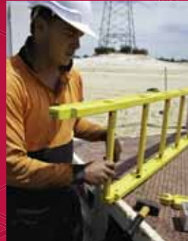
Assembling ladder to required size