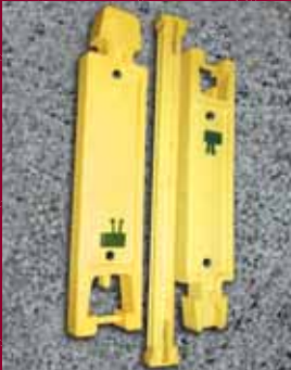
The Modular components

The ADD-A-STEP® Modular Ladder system has been designed in such a way that assembly and installation is a quick and very simple process.