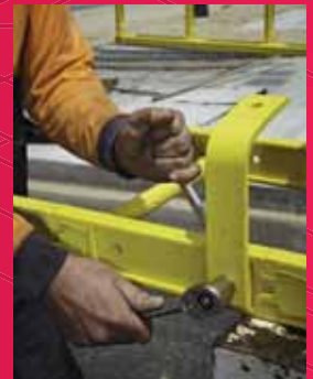
Bolting on the wall brackets