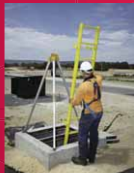
Ready to install the ladder