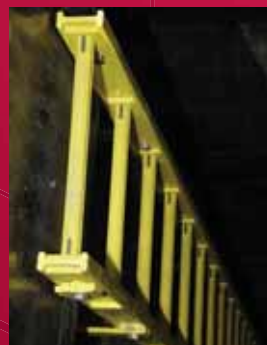
Ladder installed and ready for use