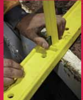
Placing in the retaining clips