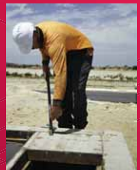
ADD-A-STEP® Job done

Typical Access Chamber 1.5m to 7.5m depth