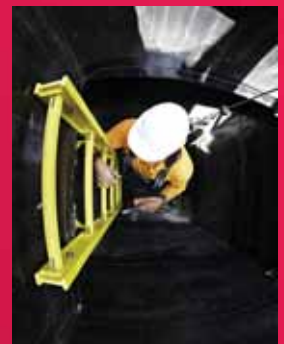
Anchoring ladder in the access chamber